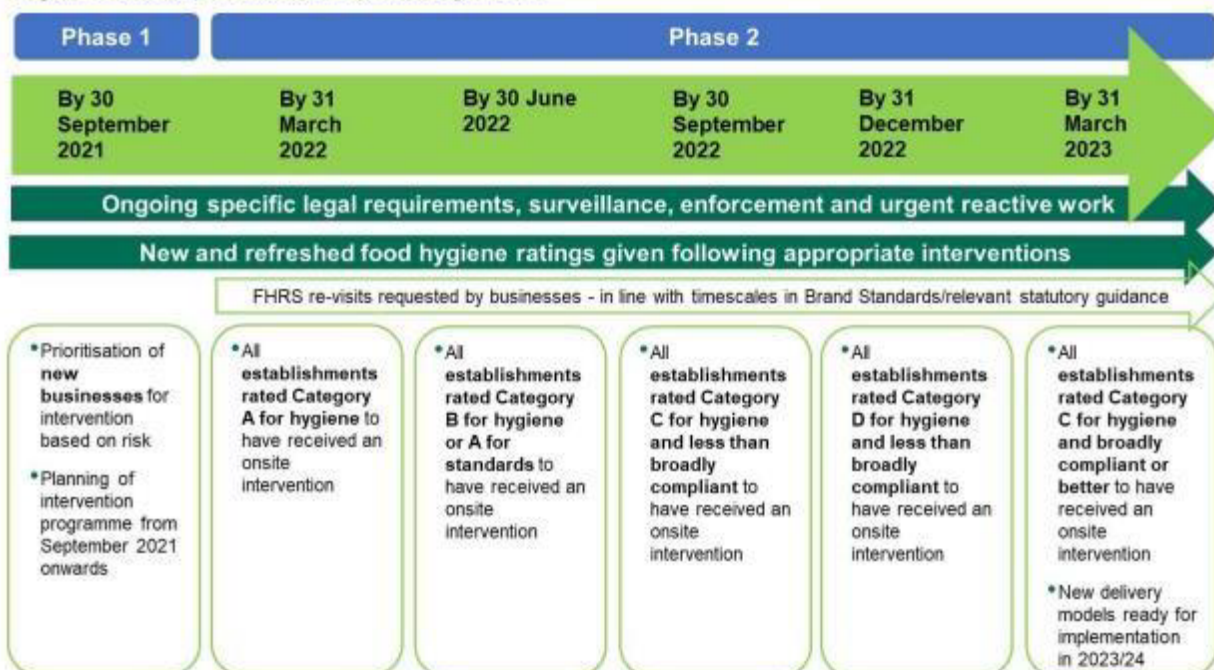
Figure 1: Outline of the Recovery Plan

For the period 2021-2024, the frequency and intervals between interventions will be carried out in accordance with the FSA Recovery Plan.